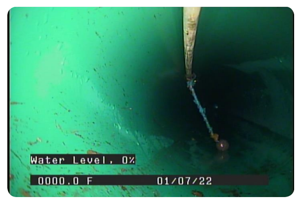
Water Level at 000.0 feet, 0%