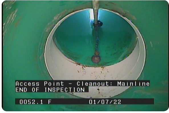
Access Point - Cleanout: Mainline at 052.1 feet | END OF INSPECTION