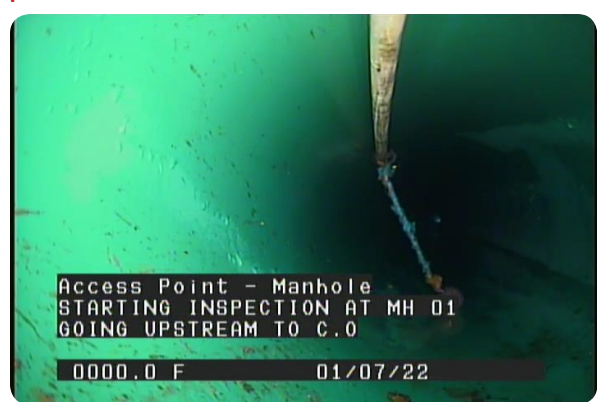
Access Point - Manhole at 000.0 feet | STARTING INSPECTION AT MH 01 GOING UPSTREAM TO CLEAN OUT